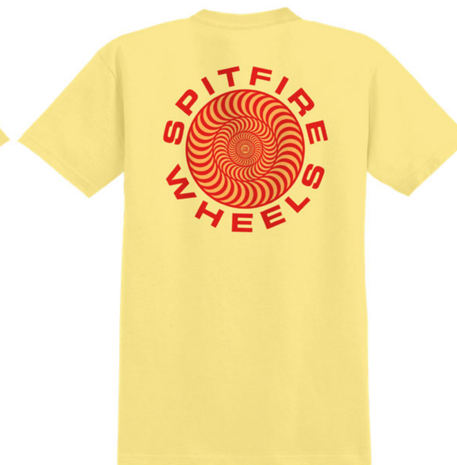
CLASSIC 87' SWIRL

PART ID: 51010651I S/S T-SHIRT - BANANA w/ RED & ORANGE Prints 5.5 oz, 100% Soft Spun Cotton