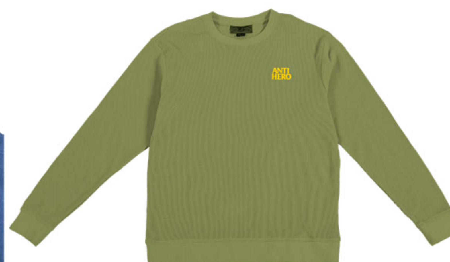
LIL BLACK HERO

PART ID: 54020002G JACKET - NAVY/BURNT ORANGE 100% Nylon 330D Taslan Packable Jacket with 100% Poly Mesh Lining