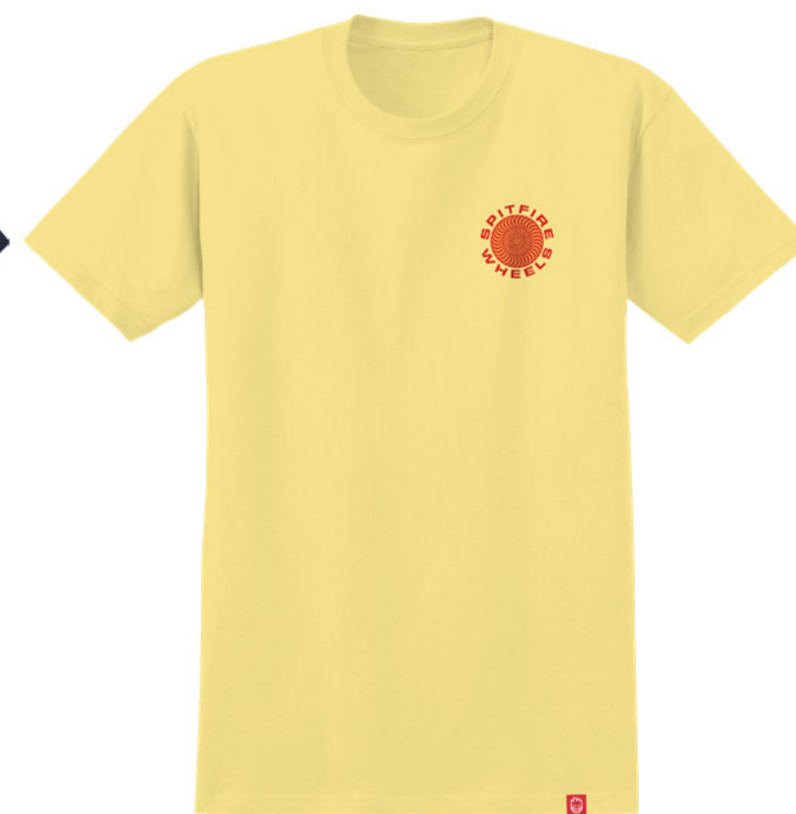
CLASSIC 87' SWIRL

PART ID: 51010651H S/S T-SHIRT - NAVY w/ SILVER FLECK & WHITE Prints 5.5 oz, 100% Soft Spun Cotton