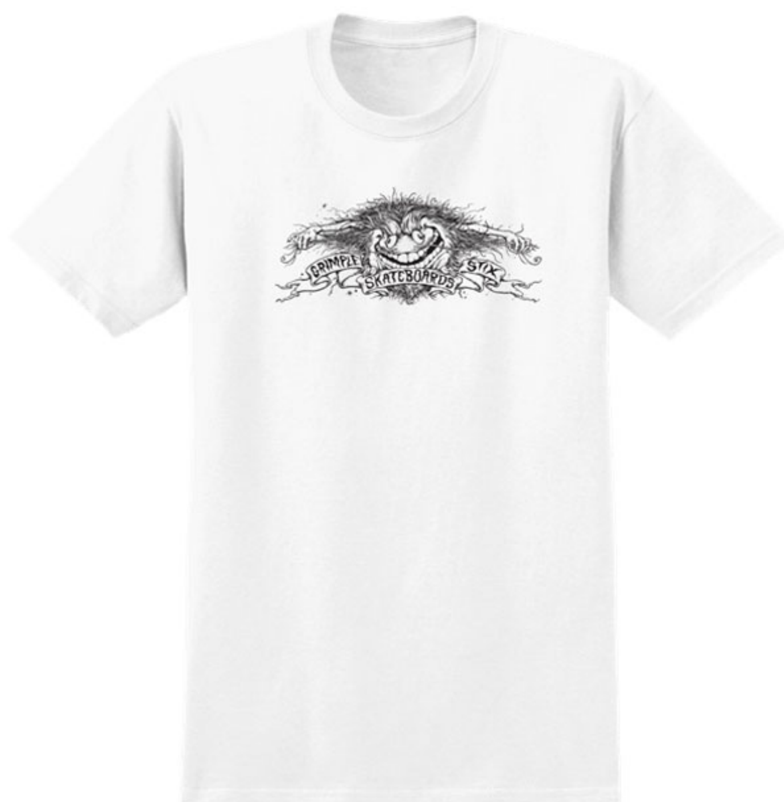
BASIC GRIMPLE EAGLE

PART ID: 53120048B PULLOVER HOOD - BLACK w/ MULTI-COLORED Print 10 oz. Heavyweight 70% Cotton/ 30% Polyester