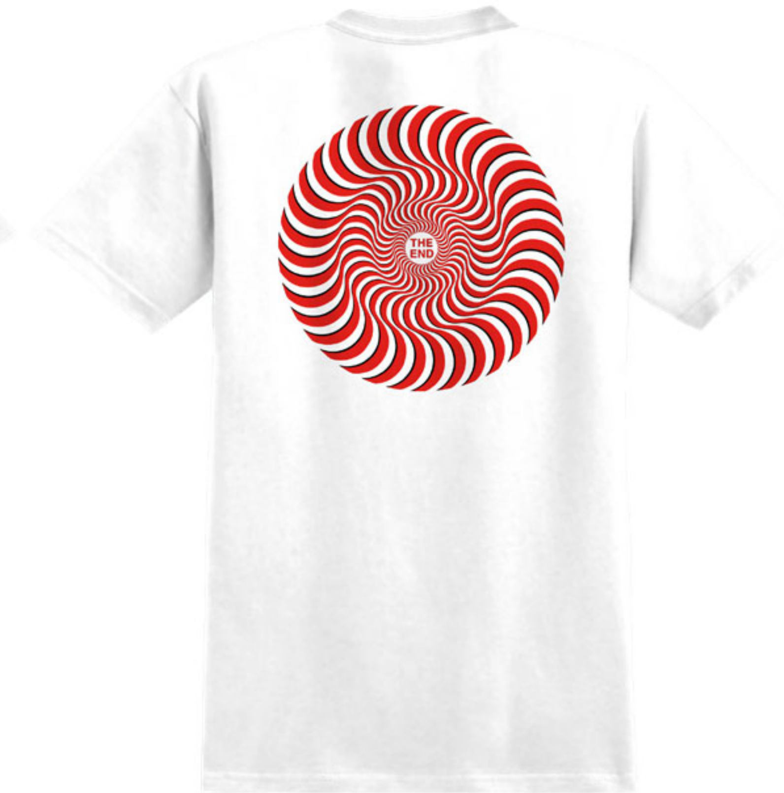
CLASSIC SWIRL OVERLAY

PART ID: 51010238AZ S/S T-SHIRT - WHITE w RED & BLACK Prints 5.5 oz, 100% Soft Spun Cotton