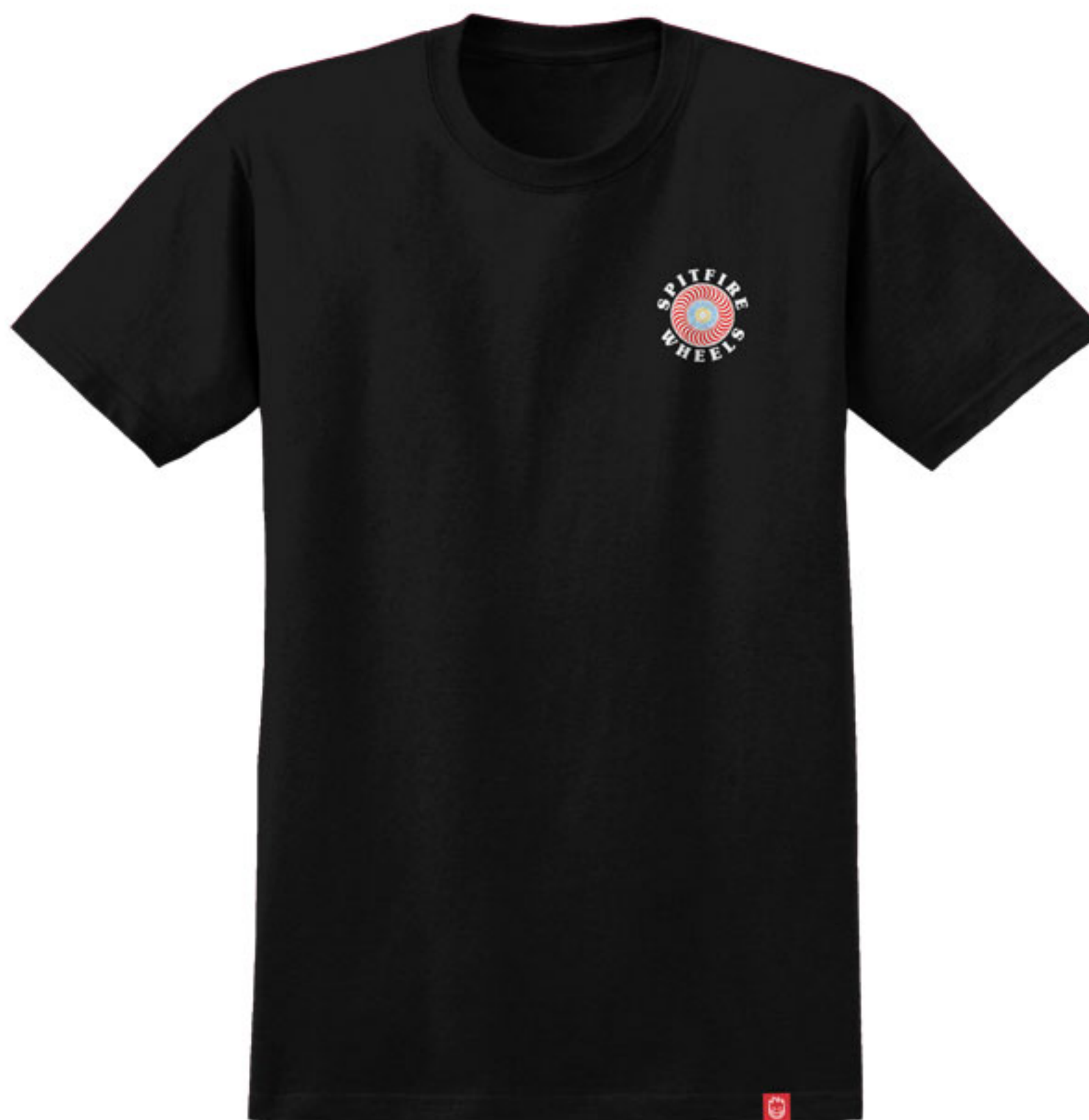
OG CLASSIC FILL

PART ID: 51010691 S/S T-SHIRT - FORREST GREEN w/ MULTI-COLORED Prints 6.0 oz 100% Cotton