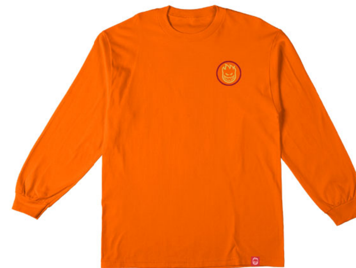
CLASSIC SWIRL OVERLAY

PART ID: 520100530 L/S T-SHIRT - BLACK w/ RED & YELLOW Prints 6.0 oz 100% Cotton