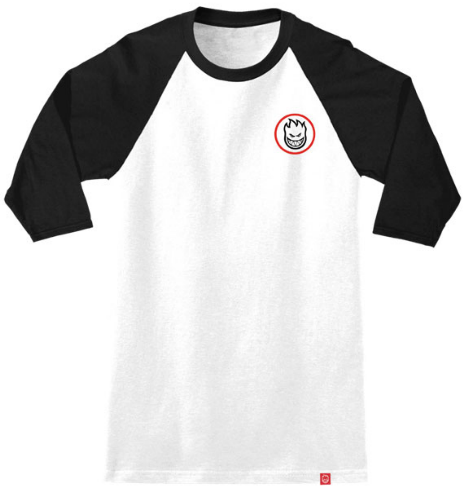
CLASSIC SWIRL OVERLAY

PART ID: 51310042A 3/4 SLEEVE RAGLAN T-SHIRT - WHITE/ BLACK w/ RED & BLACK Prints 6.0 oz 100% Cotton