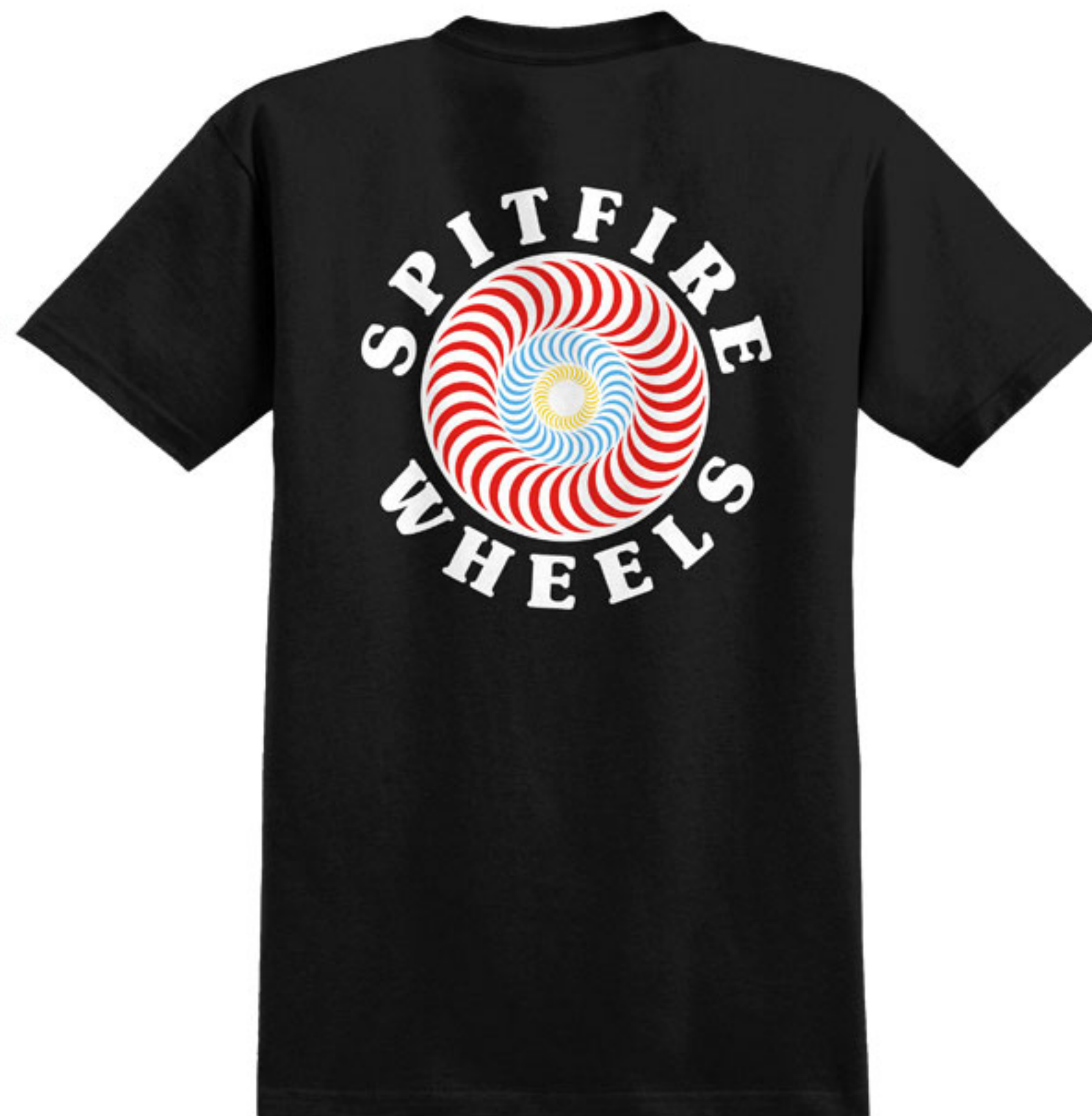
OG CLASSIC FILL

PART ID: 51010293Z S/S T-SHIRT - BLACK w/ MULTI-COL- ORED Prints 5.5 oz, 100% Soft Spun Cotton