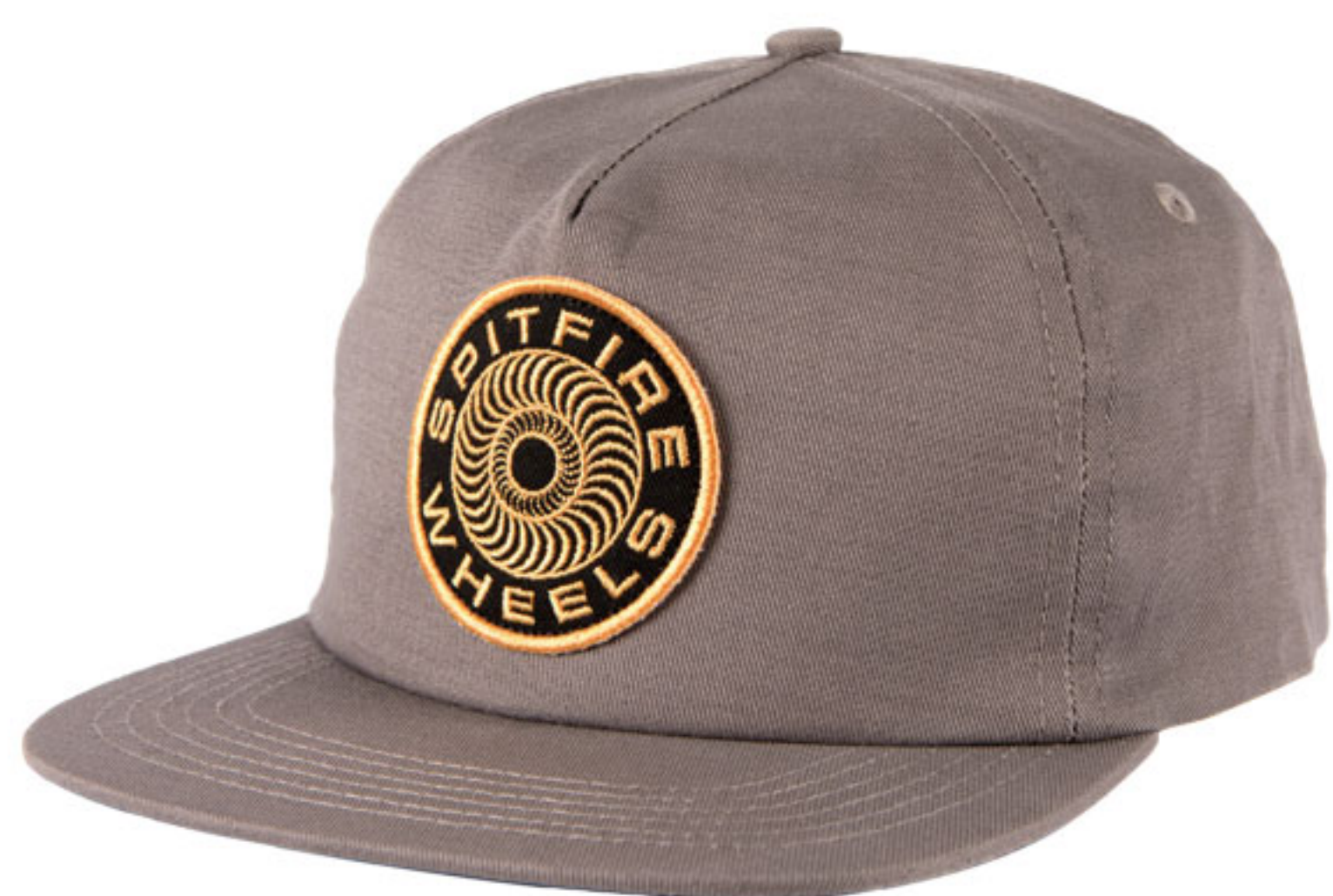
CLASSIC 87' SWIRL

PART ID: 50910008F BABY ONESIE - BLACK w/ SILVER FLECK Print 4.5 oz 100% Combed Ring Spun Cotton