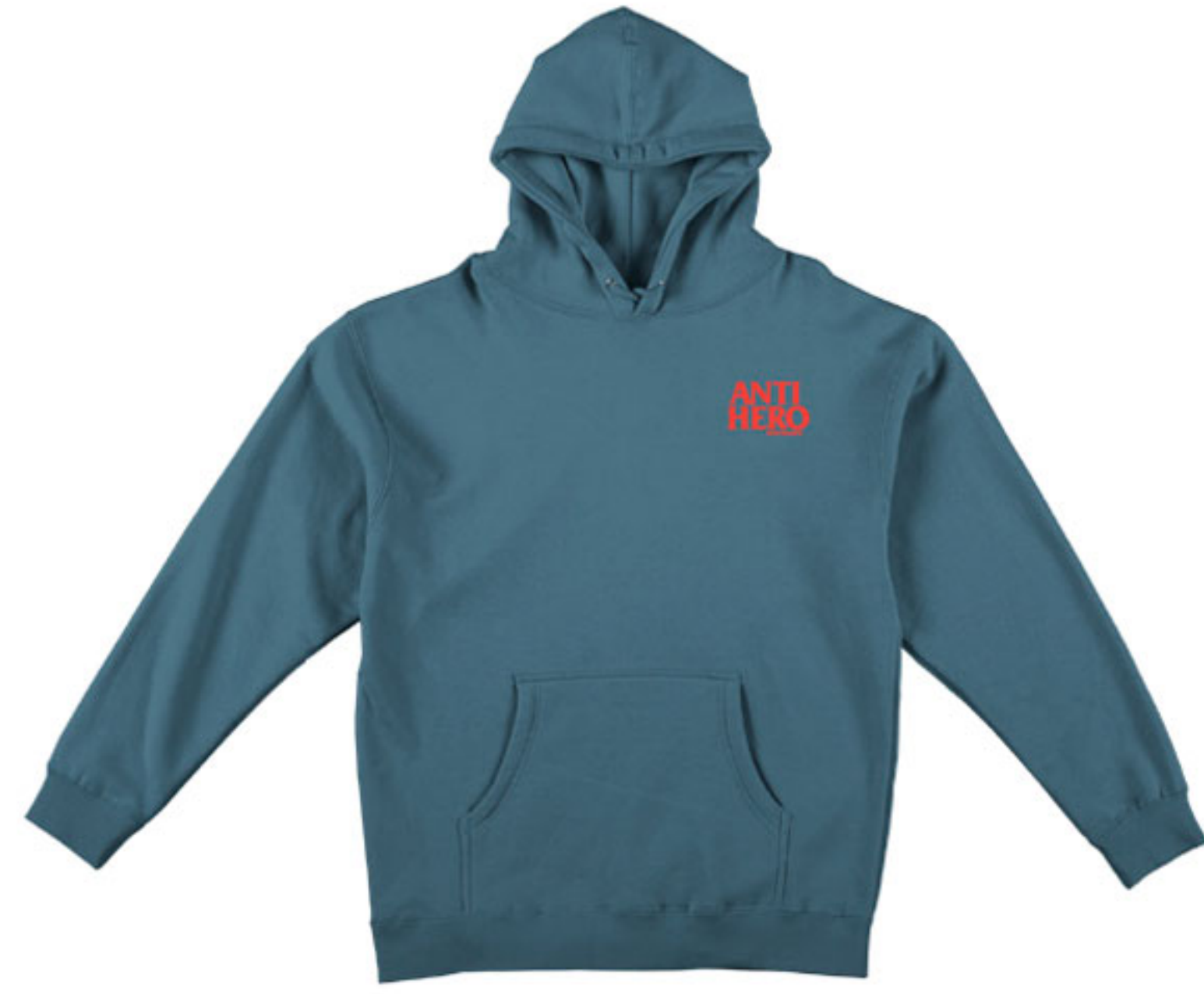
LIL BLACK HERO

PART ID: 53120001N PULLOVER HOOD - GREY HEATHER w/ MULTI-COLORED Print 10 oz. Heavyweight 52% Cotton/ 48% Polyester