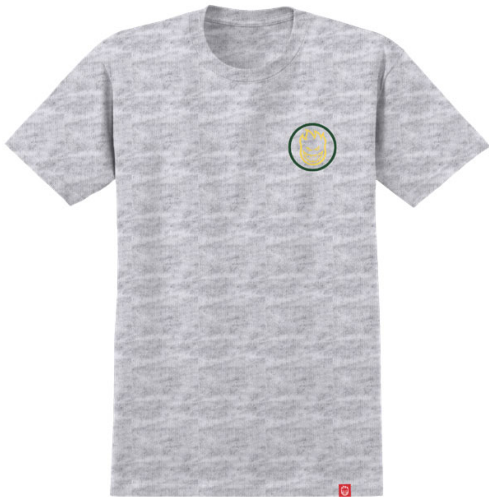
CLASSIC SWIRL FADE

PART ID: 51010238AY S/S T-SHIRT - ASH HEATHER w/ GREEN to YELLOW FADE Prints 6.0 oz, 99% Cotton/1% Polyester