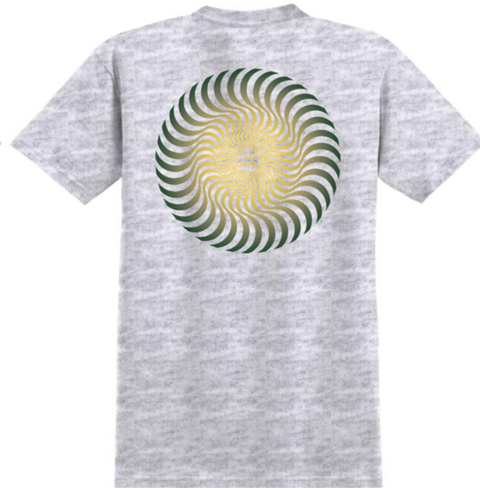
CLASSIC SWIRL FADE

PART ID: 51010238AY S/S T-SHIRT - ASH HEATHER w/ GREEN to YELLOW FADE Prints 6.0 oz, 99% Cotton/1% Polyester