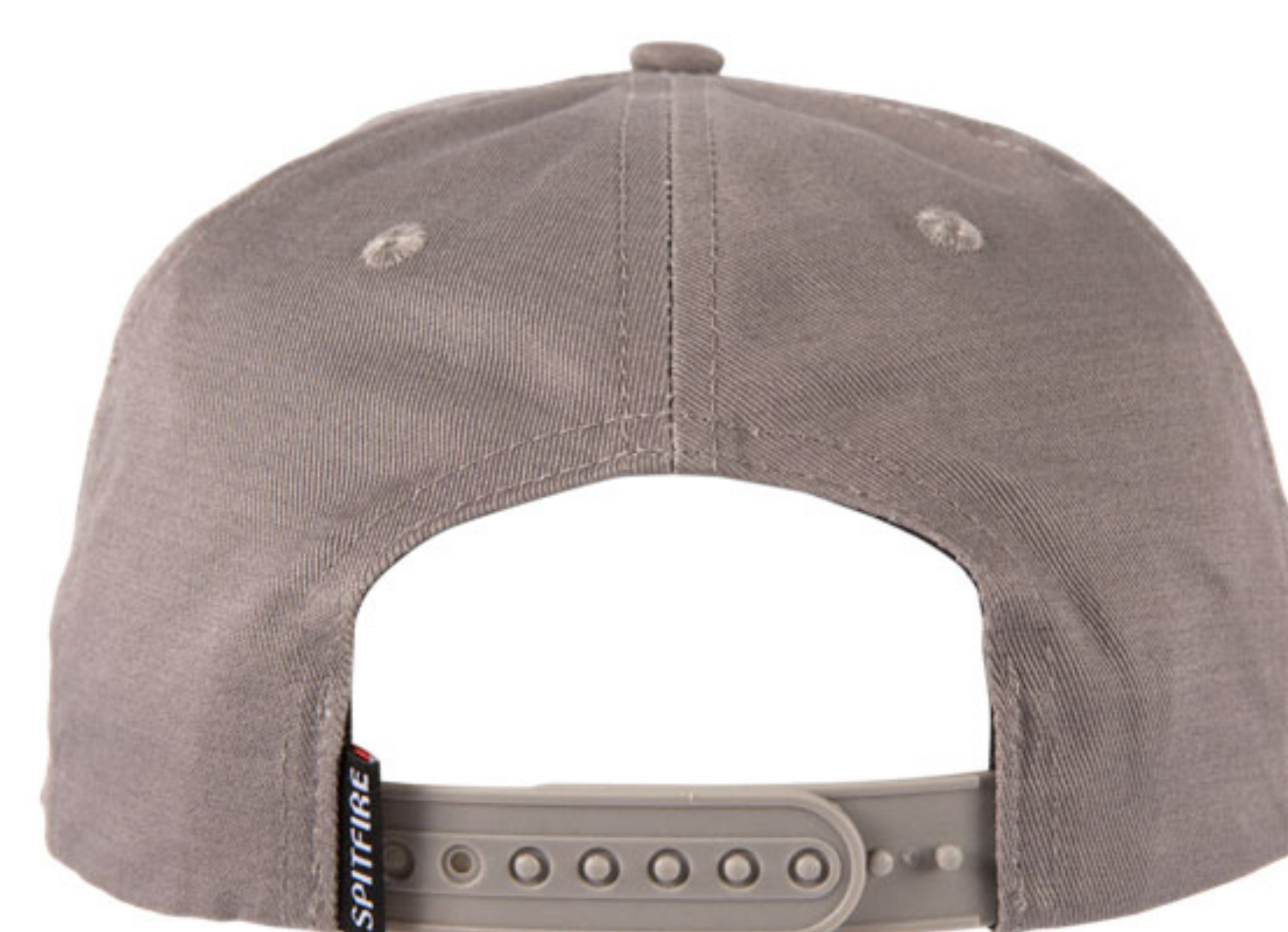
CLASSIC 87' SWIRL

PART ID: 50010194K00 SNAPBACK - CHARCOAL/ORANGE Mid profile unstructured 5 panel cotton twill snap-back hat with mesh stay front support, merrowed edge embroidered patch and flag label