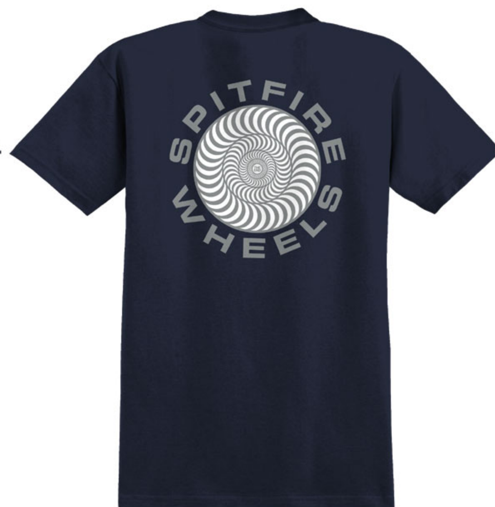
CLASSIC 87' SWIRL

PART ID: 51010651H S/S T-SHIRT - NAVY w/ SILVER FLECK & WHITE Prints 5.5 oz, 100% Soft Spun Cotton