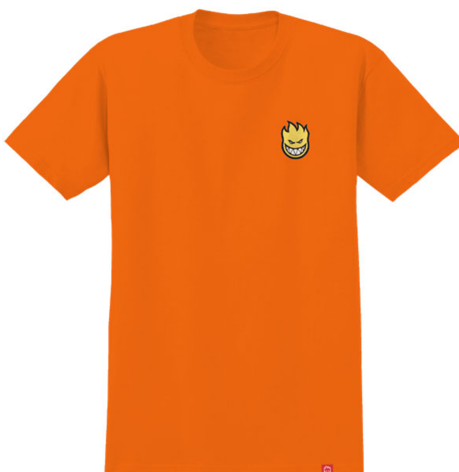
LIL BIGHEAD FILL

PART ID: 51010388AB S/S T-SHIRT - ATHLETIC HEATHER w/ GOLD Print 5.5 oz, 90% Soft Spun Cotton/10% Polyester