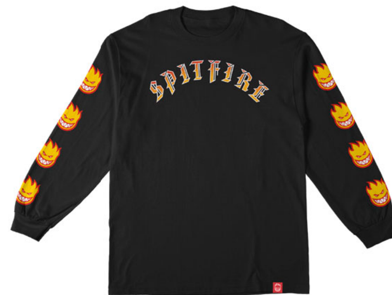
OLDE E BIGHEAD FILL SLEEVE

PART ID: 52010123 L/S T-SHIRT - NAVY w/ MULTI-COLORED Prints 6.0 oz 100% Cotton