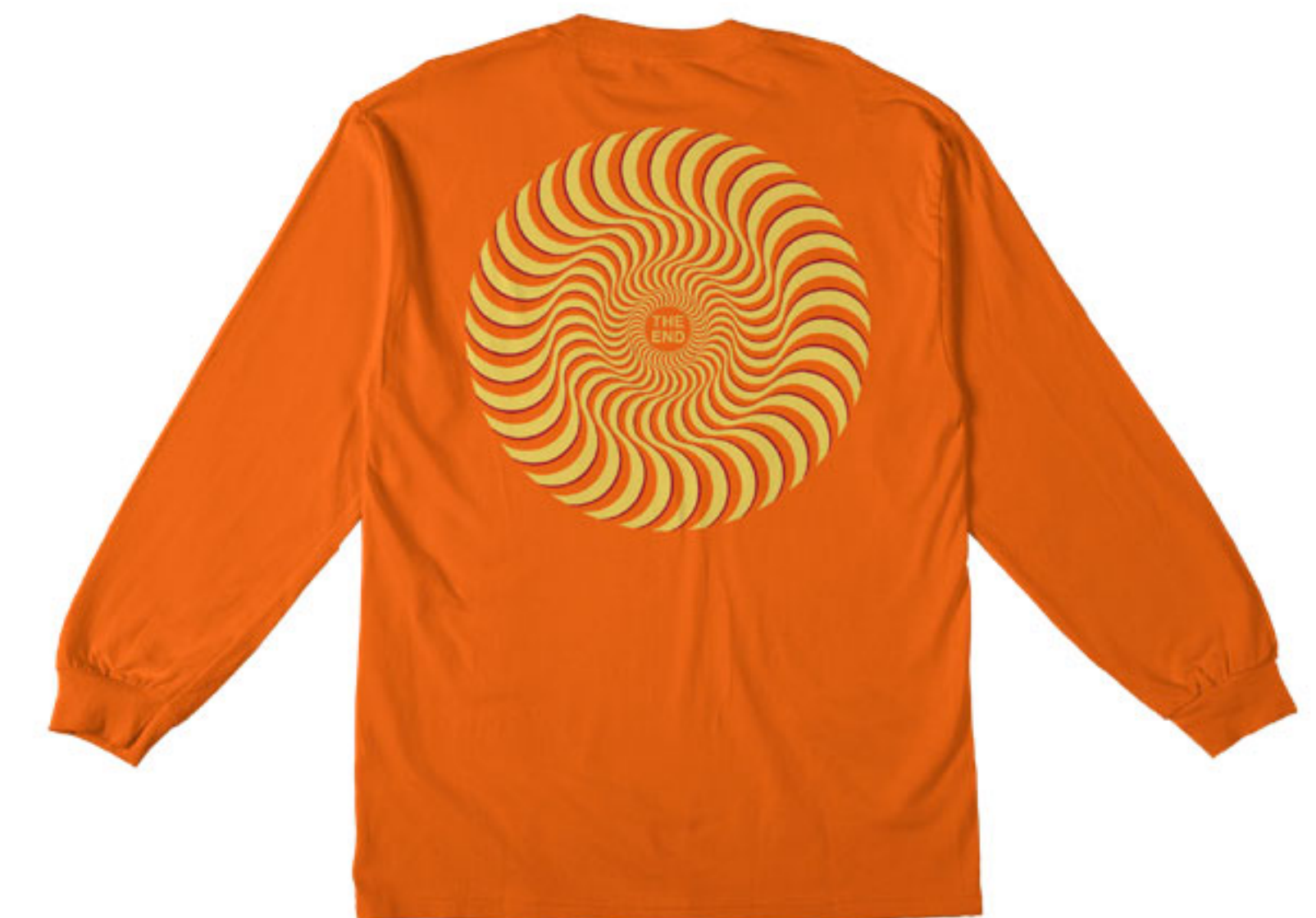
CLASSIC SWIRL OVERLAY

PART ID: 52010016V L/S T-SHIRT - ORANGE w/ YELLOW & RED Prints 6.0 oz 100% Cotton