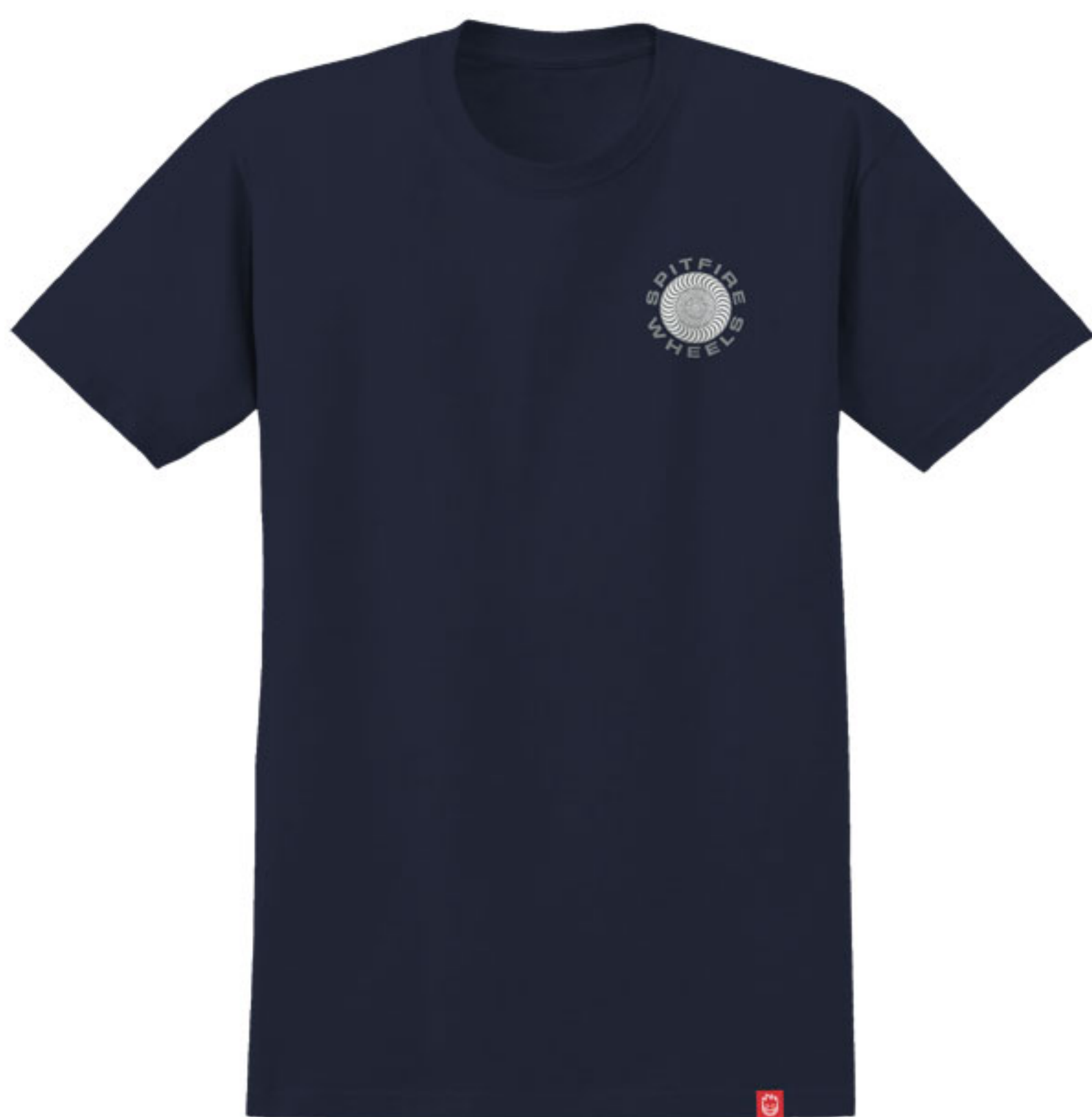
CLASSIC 87' SWIRL

PART ID: 51010238AZ S/S T-SHIRT - WHITE w RED & BLACK Prints 5.5 oz, 100% Soft Spun Cotton