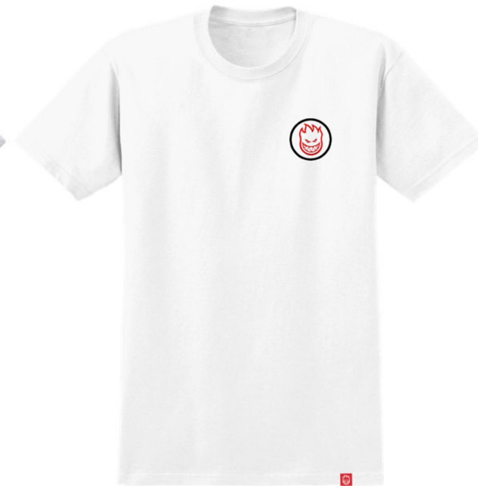
CLASSIC SWIRL OVERLAY

PART ID: 51010238AY S/S T-SHIRT - ASH HEATHER w/ GREEN to YELLOW FADE Prints 6.0 oz, 99% Cotton/1% Polyester