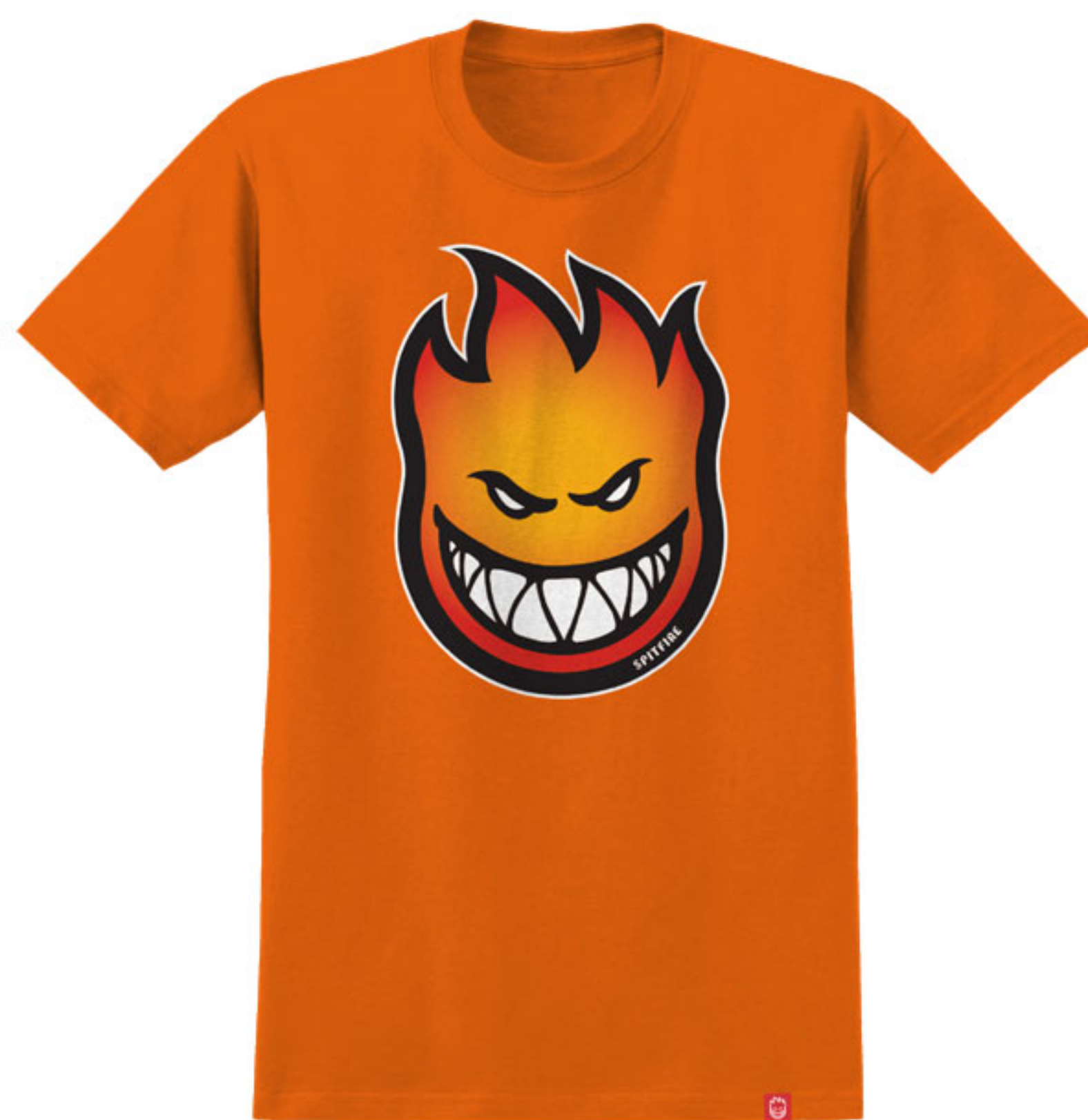
BIGHEAD FADE FILL

PART ID: 51010001HC YOUTH S/S T-SHIRT - BLACK w/ SILVER FLECK Print 6.0 oz 100% Cotton