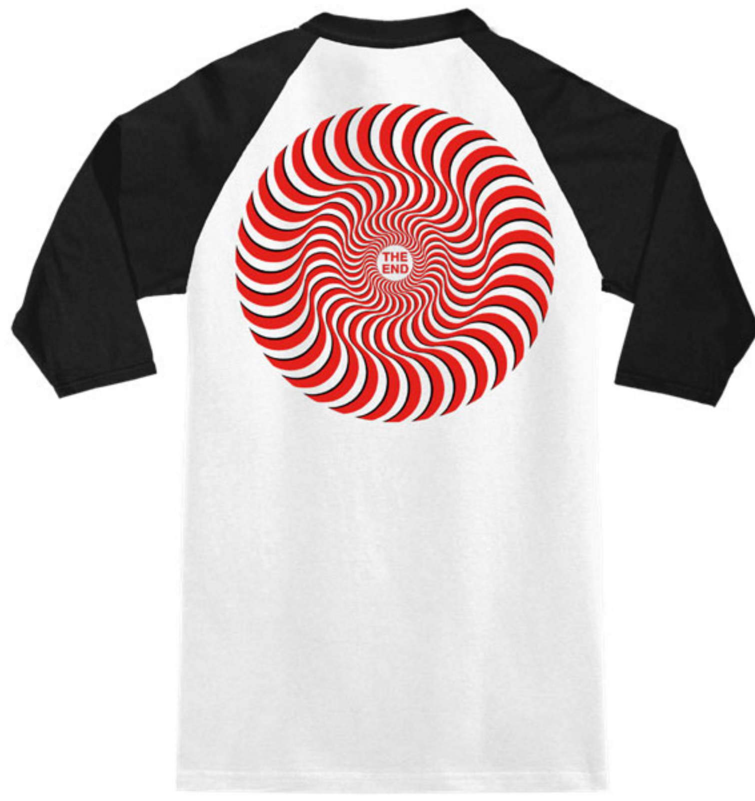
CLASSIC SWIRL OVERLAY

PART ID: 51310042A 3/4 SLEEVE RAGLAN T-SHIRT - WHITE/ BLACK w/ RED & BLACK Prints 6.0 oz 100% Cotton