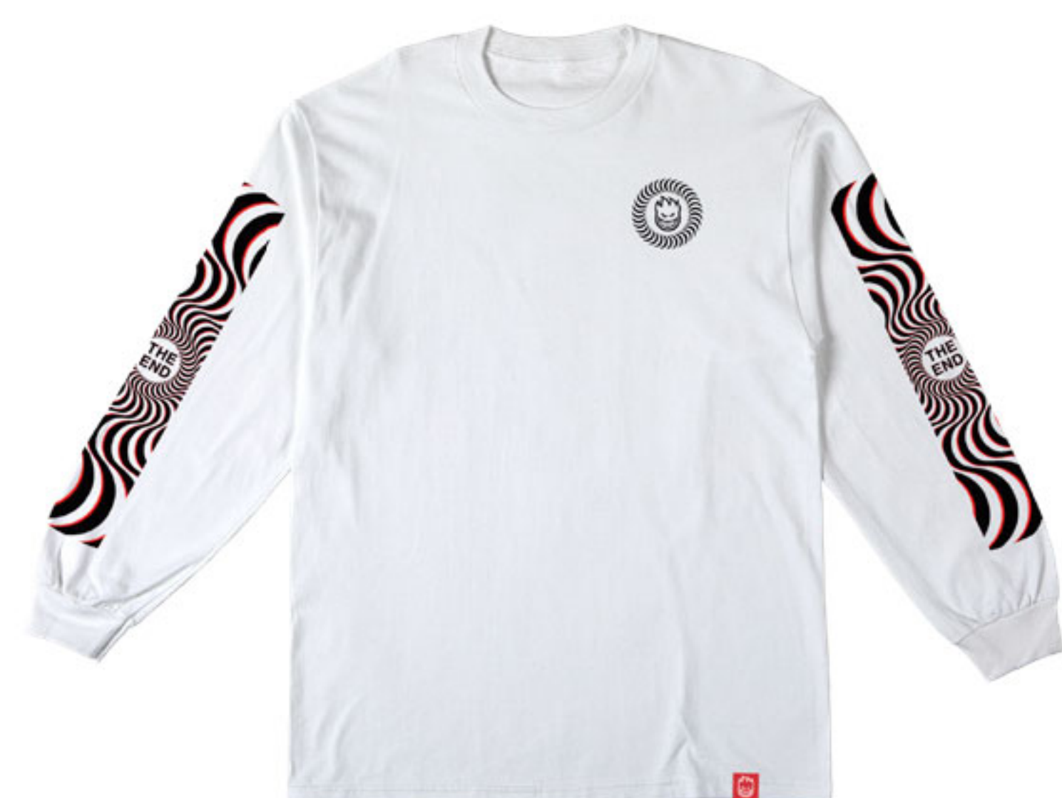
CLASSIC SWIRL SLEEVE OVERLAY

PART ID: 52010016V L/S T-SHIRT - ORANGE w/ YELLOW & RED Prints 6.0 oz 100% Cotton